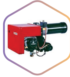
HEAVY OIL GAS BURNERS