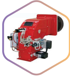
BURNER FOR INDUSTRIAL APPLICATIONS