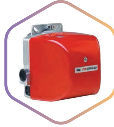
LIGHT OIL BURNER